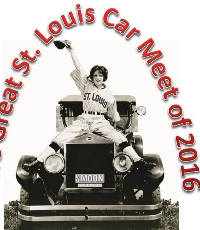
Clara Bow on a Moon, circa 1926